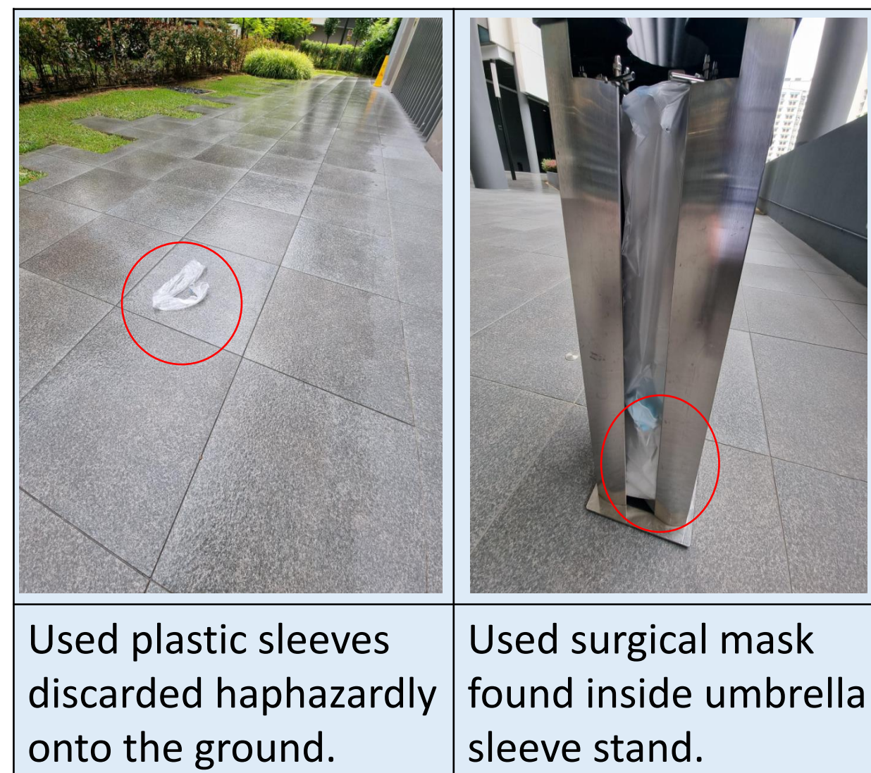
Used plastic sleeves discarded haphazardly onto the ground. Used surgical mask found inside umbrella sleeve stand.